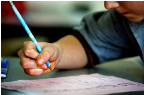
Sitting a test

What are 3 ways that the person in their picture gets ready for what they're doing?