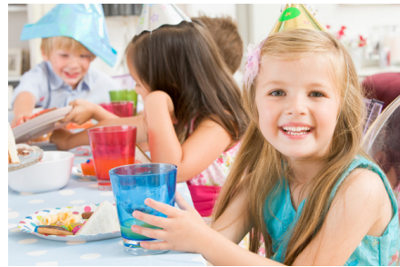
Going to a birthday party