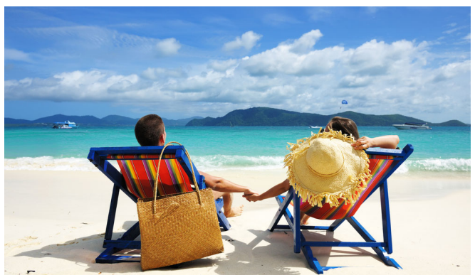
Going on holiday